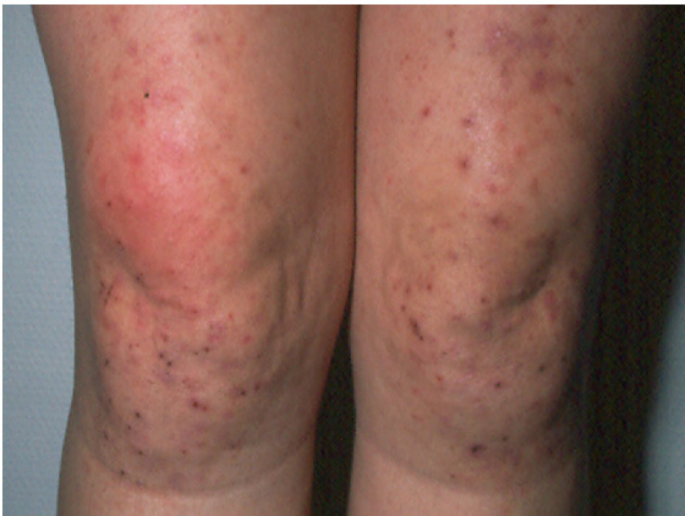
Figure 2: Custry DH lesions in both knees.

Primary DH lesions are characterized by the presence of grouped erythematous papules, urticarial plaques, surmounted by vesicles, or also blisters, which may be often replaced by erosions and excoriations, because of the intense itching, characteristically associated with this condition. Chronic pruritus and excoriations might lead to its lichenification (Figures 2 and 3). Furthermore, a postinflammatory hyperpigmentation may occur when the lesion resolves [119–121].