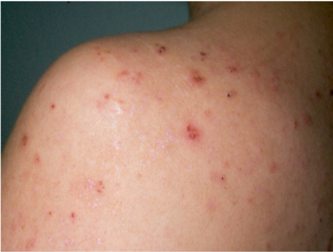
Figure 3: Several evolutive DH lesions in left shoulder and back.

The symmetrical distributions of the herpetiform lesions on the extensor surfaces of the elbows (90%), knees (30%), shoulders, middle line of the back, buttocks, and sacral region are the main affected localizations that are the site of constant minor trauma and is also a typical feature of the disease [122]. Anyway, scalp, nuchal area, face, and groins may be also involved. No clinical differences were described between darker and white-skinned individuals, although DH remains primarily predominant in Caucasian population, being rarer in Asian populations, including the Japanese [123].